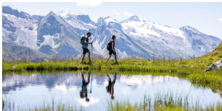
From leisurely hikes to mountain huts serving food and drinks to challenging summit tours, Tux-Finkenberg has something for everyone.

THE HIKING PARADISE of Tux-Finkenberg offers some impressive panoramas. Crystal-clear mountain lakes, rushing waterfalls, blooming Alpine meadows and a fascinating world of flora and fauna, the scent of stone pine forests – all this is fascinating on hiking and (e-)mountainbike tours or the numerous bike & hike possibilities in the Tux Alps. 350 kilometres of mountain hi-