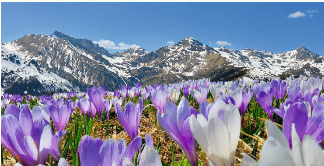
In the right place, at the right time. Some motifs are only visible for a few days a year. Paul Sürth captured the early spring crocus blossom in the Tux Valley in a colourful panoramic shot. Thomas Pfister captured the Milky Way at Schleierwasserfall waterfall.