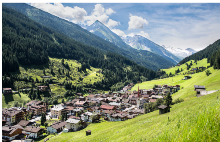
In Tux-Finkenberg, there is particular potential in the use of hydropower and solar energy through additional photovoltaic systems.

C limate protection and energy autonomy have been important topics in Tux-Finkenberg for many years. Tyrol aims to be independent of fossil fuels by 2050. Its goal for future generations is to be able to meet all energy requirements from domestic, renewable resources in a climate-friendly way. Tux-Finkenberg is also working towards this aim. An important step in this respect was the founding of Tuxertal Energy Community (EEG) in March 2025. The purpose of EEG