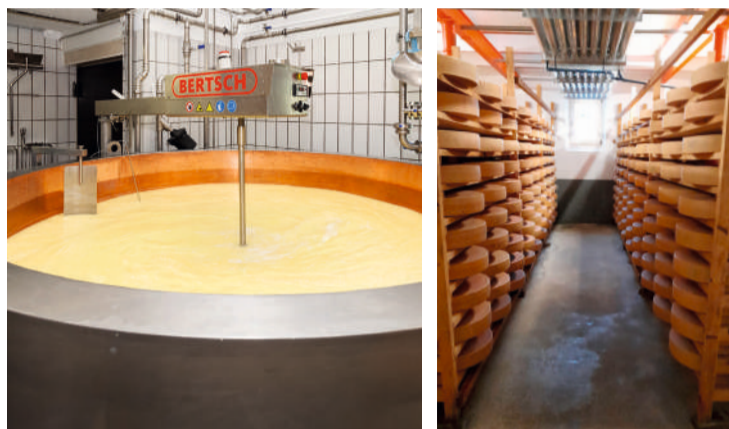
After production in the Alpine dairy (left), the cheeses are stored for several months in the maturing cellar (right).

C heese has been produced at Junsberg for centuries. The alpine cheese dairy is the only one in the Tux Valley that is still fully operational. Junsberg cheeses are highly renowned and have received multiple awards. In order to further improve quality and ensure the preservation of the mountain dairy, the operators are investing several hundred thousand euros in a new, modern maturing cellar, which will be built this summer in Juns.