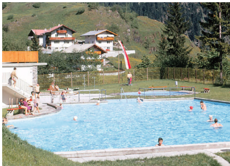
The well-frequented and popular Finkenberg outdoor adventure pool is just the right refreshment after an eventful hike or (e-)mountainbike tour.