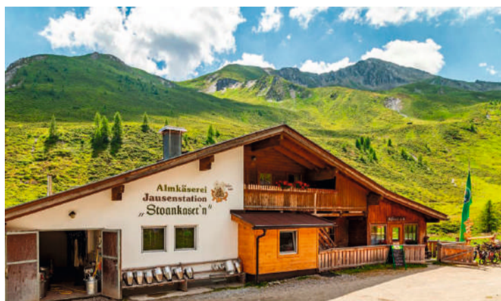
Stoankasern Alpine dairy is a unique combination of nature, tradition and pleasures of the palate. Whether you visit for the hiking, the culinary delights, or to experience traditional cheese-making at first-hand, a trip here is always worthwhile.

S toankasern Alpine dairy (1,984 m) is located above the villages of Juns and Tux-Lanersbach in a ruggedly romantic alpine valley. It belongs to Junsalm mountain farm. 'Stoankasern' (a combination of the German words 'stone' and 'cheese-making') is the name given to the high-altitude area of these alpine grazing lands. Those willing to undertake the two-and-a-half-hour uphill walk to the cheese dairy will be rewarded with breathtaking natural scenery.